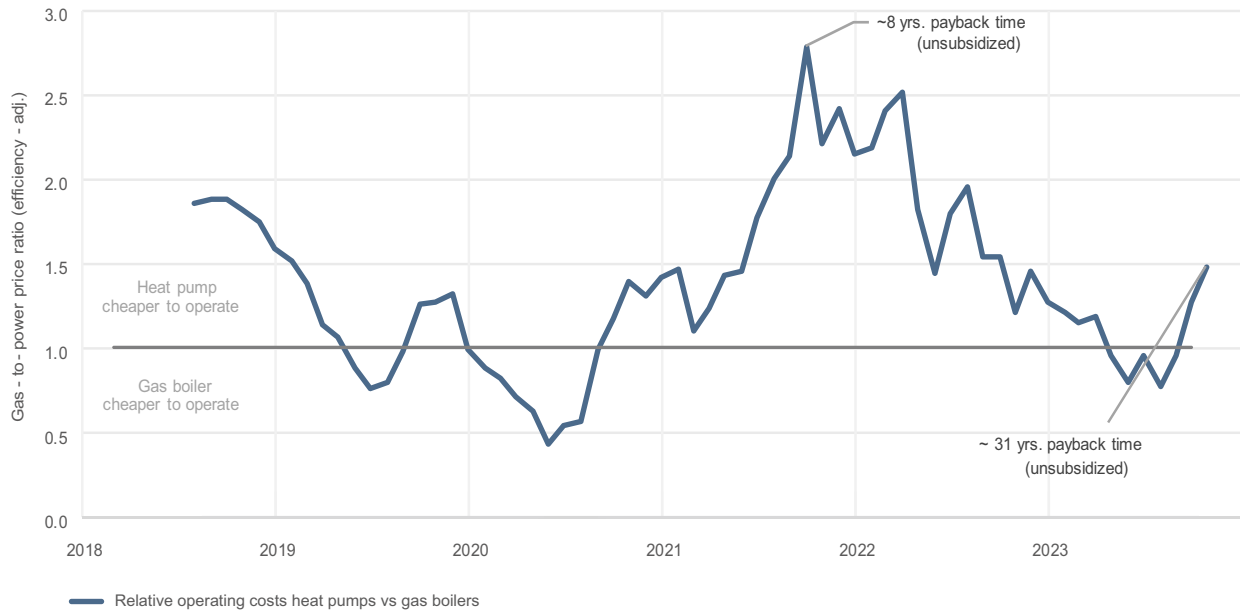
Figure 3 Gas price in relation to electricity price

Calculations exclude taxes and levies and are therefore approximate.